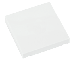
1x ON/OFF RTS22-ACC-02-xxP